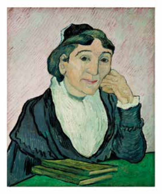
Vincent van Gogh, L'Arlésienne (Madame Ginoux) , Saint-Rémy-de-Provence, February 1890 Oil on canvas, 60 × 50 cm Galleria nazionale d'Arte moderna e contemporanea, Rome

Niko Pirosmani, Giraffe Oil on wax cloth, 138 x 112 cm Georgian National Museum, Shalva Amiranashvili Museum of Fine Arts, Tbilisi