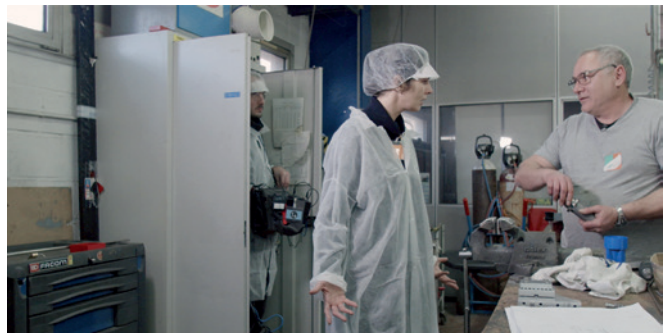
Emmanuelle Lainé, Incremental Self: transparent bodies , 2017 Film, 20 min.