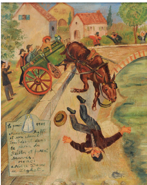
Anonymous ex-voto, Marseille, c. 1901 Musée des civilisations de l'Europe et de la Méditerranée