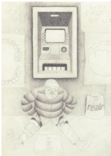
Michael Hakimi, Why can't I B U? , 2019 Pencil on paper, 21 x 14,8 cm Courtesy of the Artist