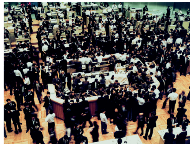
Andreas Gursky, Tokyo, Stock Exchange , 1990 Kunstmuseum Basel, Switzerland C-Print / Diasc, framed 170 x 205 x 5 cm