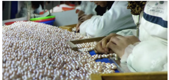
Mika Rottenberg, Nonoseknews (50 kilos variant) , 2015 Film, 22 min. © Mika Rottenberg