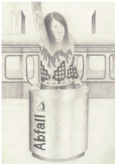
Michael Hakimi, Abfall , 2019 Pencil on paper, 21 x 14,8 cm Courtesy of the Artist