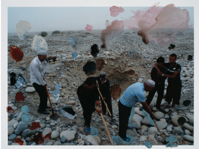
Liu Xiaodong, Mining Jade I , 2012 Acrylic on photo paper, 41,5 x 54,5 cm Courtesy of Liu Xiaodong Studio, 2012 © Adagp, Paris, 2019