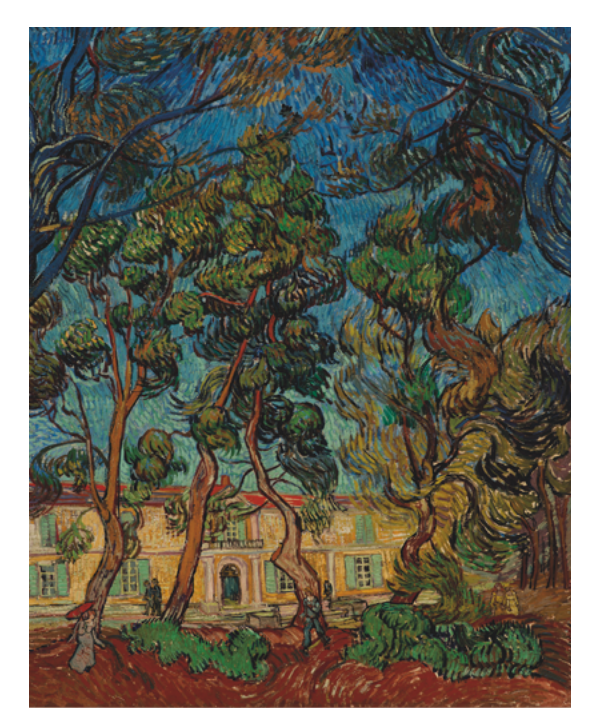
Vincent van Gogh Hospital at Saint-Rémy, Saint-Rémy-de-Provence, October 1889 Oil on canvas, 92.2 × 73.4 cm Gift of the Armand Hammer Foundation Hammer Museum of Art, Los Angeles